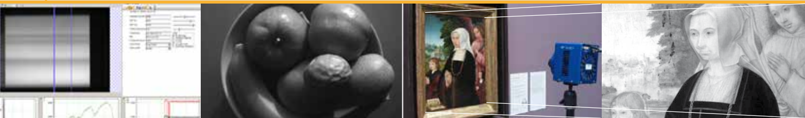
⌘ R&D SWIR