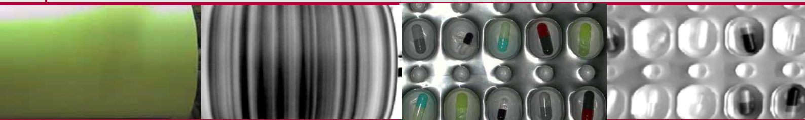
☞ Moisture detection in paper: visible vs. SWIR